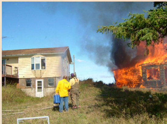
Thermo-Gel® Providing Exposure Protection

Adjacent structure protection or exposure protection has become a problem for all city and rural fire departments. Saving surrounding homes during a structure fire is as important as extinguishing the fire.